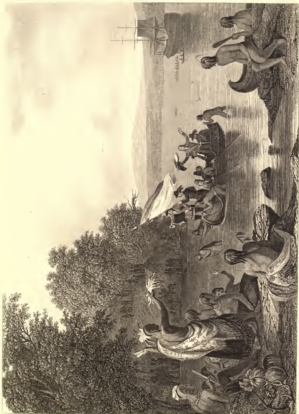
THE NATIVE AMERICANS OF THE BAY OF FUNDIA, 1848.